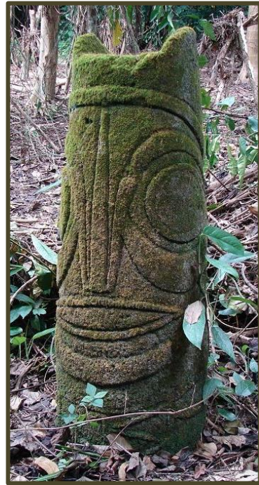
FIGURE 2 – A STONE PEDESTAL IN THE TORRES ISLANDS.

The beverage called kava ( Piper methysticum ) is reserved to men, and linked with the supernatural power (* mana ) that characterizes men of power.