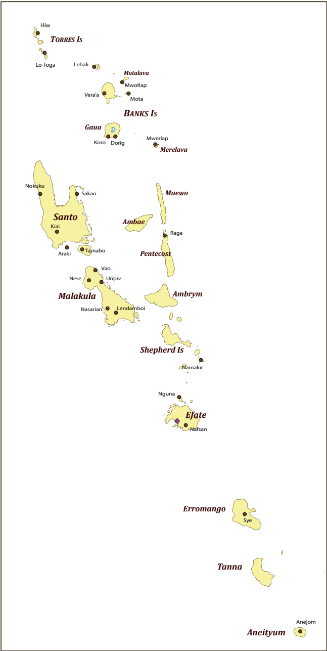
MAP 1 – LANGUAGES OF VANUATU SHOWING REFLEXES OF *TABU, AND CITED IN THIS STUDY.