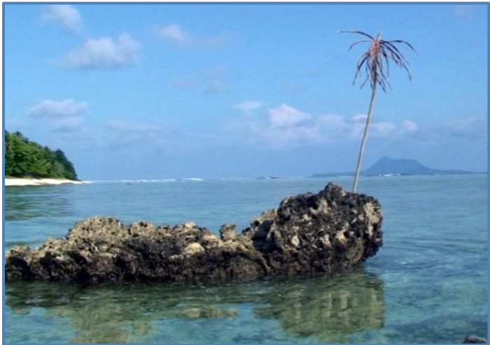
FIGURE 1 – A ‘TABOO’ SIGN MEANT TO BAN FISHING ACTIVITIES IN THE LAGOON FOR A PERIOD.

3.1.3 Forbidden mention. One particular type of prohibition is one that prevents speakers from mentioning a particular topic of conversation. This is the sense closest to taboo in modern English: